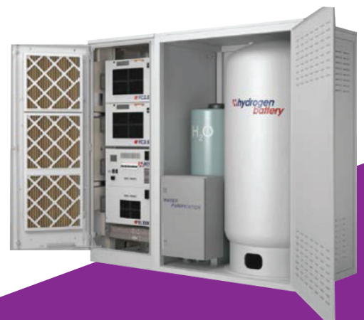
5kW Fuel Cell system with Electrolyzer, Water Collection Tank and Hydrogen Tank